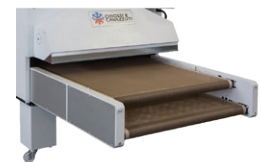
DOUBLE BELT CONVEYOR SIDE BY SIDE