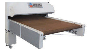
SINGLE BELT CONVEYOR