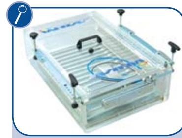
• Optional flocking modules can be installed into any station.